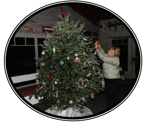
PJ Adler Trimming the Tree