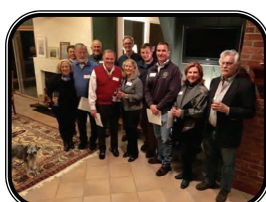
Piloting Graduation Party