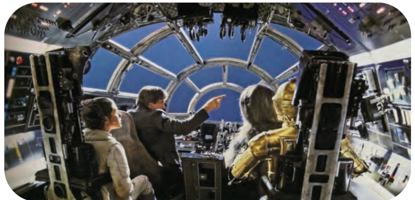
Advanced Piloting Class